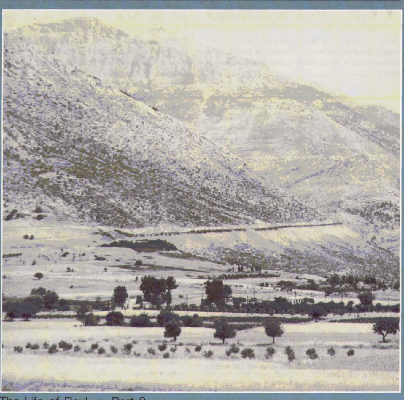
The Life of Paul - Part 3