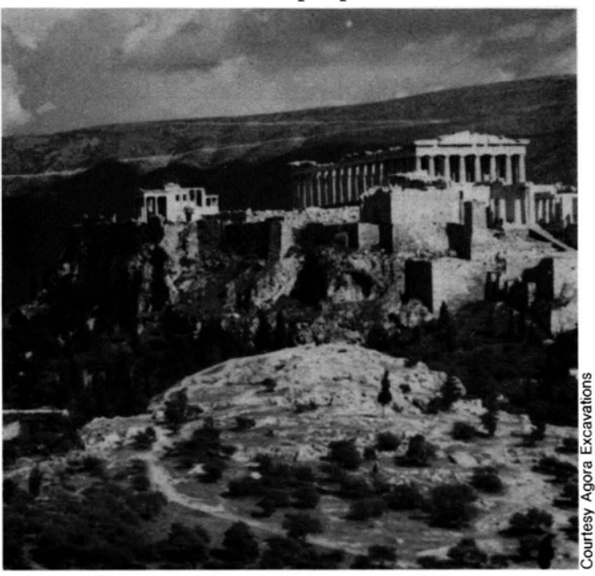
Mars Hill in Athens (foreground), is where Paul preached to the curious Greek philosophers.

Beginning with the tower of Babel, God caused the nations to migrate out of the regions He intended for them. The descendants of Japheth primarily migrated to the eastern part of the world called the Orient. The descendants of Ham are the black peoples who settled in